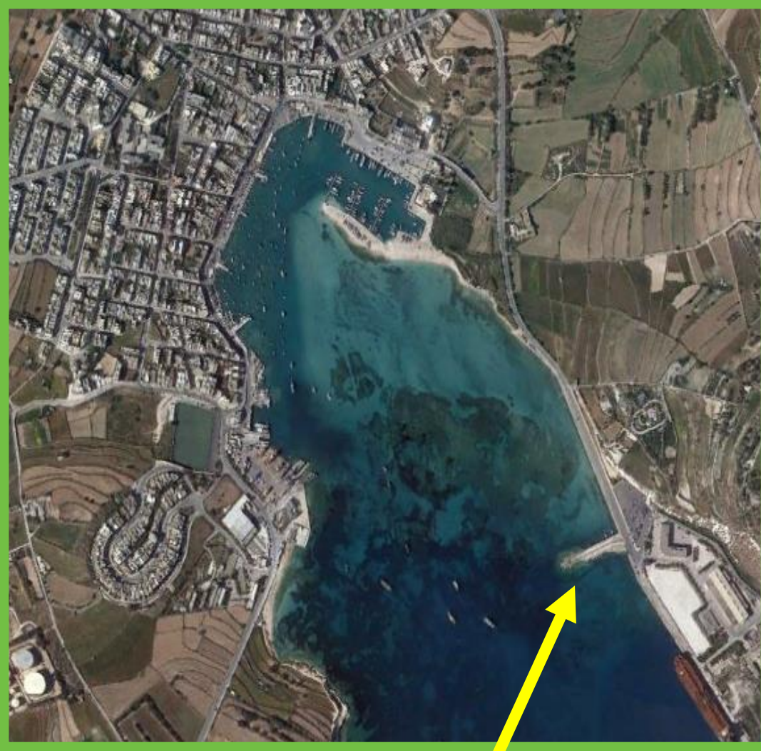
Old, broken breakwater